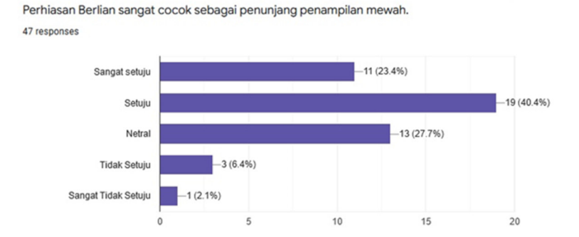
Figure 3. Product Quality Survey Results for Diamond Shops Consumers at the Medan City Center

Judging from the diagram above, it is known that of the 47 respondents who have answered. As much as 40.4% chose to agree and be neutral in terms of cleanliness of diamond stones and high gold content. Where it is known that stone purity and incoming gold content are indicators of product quality. So the results of this survey indicate that the cleanliness of the stone and high gold content is one of the factors that consumers pay attention to when they buy a product or service.