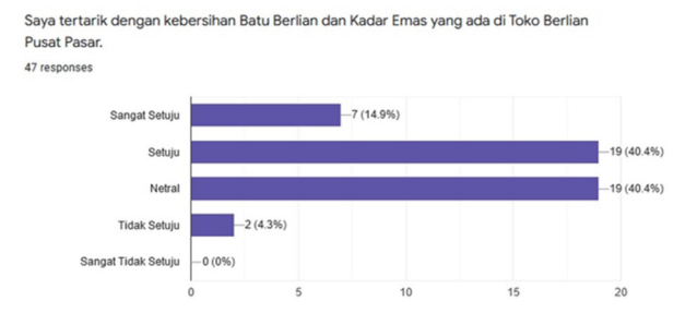
Figure 2. Product Quality Survey Results for Diamond Shops Consumers at the Medan City Center

The price of gold often fluctuates so there is no price stability and often competes with other diamond shops which are also often a consideration for customers in making a decision to buy diamonds at Pusat Pasar. For the price itself, the diamond shops in the Central Market are much cheaper than the diamond shops in the Mall.