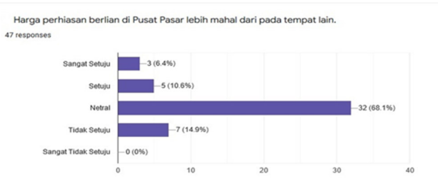
Figure 1. Price Survey Results for Diamond Shops Consumers in Medan City Market Center

The types of diamond jewelery sold by shops in Central Pasar Central vary, including; necklaces, pendants, earrings, bracelets, rings and brooches. The Central Market Medan diamond shops also offer a variety of attractive designs in the form of various forms of Diamond Shops. The number of consumers in terms of product selection, by sorting and selecting to get product conformity. On this basis, the authors conducted a survey of several Diamond Shops consumers in the Central Market in Medan City and obtained the following results: