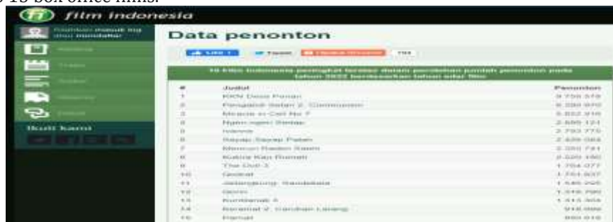
Figure 1. Movie audience in Indonesia

Despite the formidable challenges posed by the two-year-long COVID-19 pandemic, the film sector in Indonesia is undergoing a remarkable surge in growth (Alexandri & Arifianti, 2019). The enforced social restrictions and temporary cinema closures during this period halted the industry's activities (Moon, 2020; Nhamo et al., 2020). The industry, which faced setbacks due to social restrictions and temporary cinema closures, is now experiencing a robust resurgence, instilling optimism for the future (Zhang, 2022; Mburu, 2022). To gauge cinema viewership, valuable data can be acquired from filmindonesia.or.id. (2023), revealing that the top 15 highest-grossing films in Indonesia in 2022 amassed 44,374,795 viewers by December 2022. Noteworthy is the dominance of the horror genre, comprising 64.54% of the top 15 box office films.