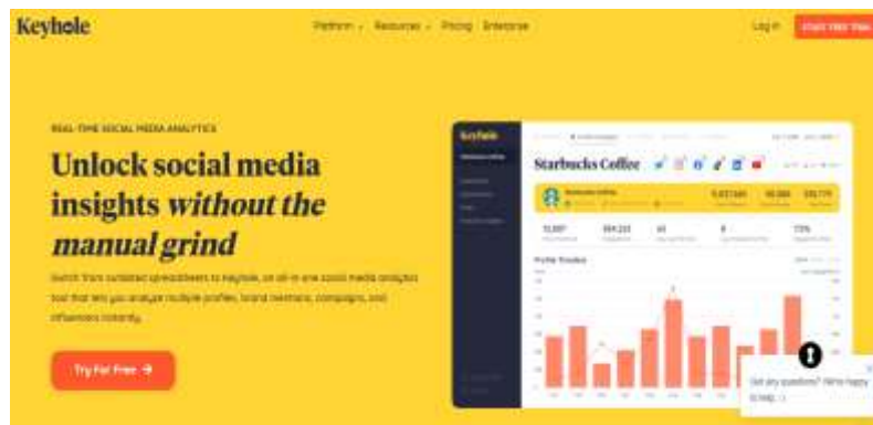
Figure 3. Real-Time Social Media Analytics

Control focuses on measuring and assessing the performance of the social media marketing strategy against set targets. Monitoring can be conducted daily, weekly, or monthly using tools like Keyhole.co.