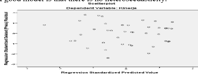
Figure 2. Heteroscedasticity Test Results

Heteroscedasticity is used to test whether, in the regression model, there is an inequality of variance from another observation. If the residual variation from one observation to another observation remains, it is called homoscedasticity, and if the variance is different it is called heteroscedasticity. A good model is that there is no heteroscedasticity.