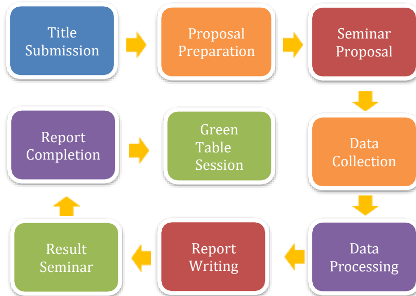
Figure 1. Research Chart