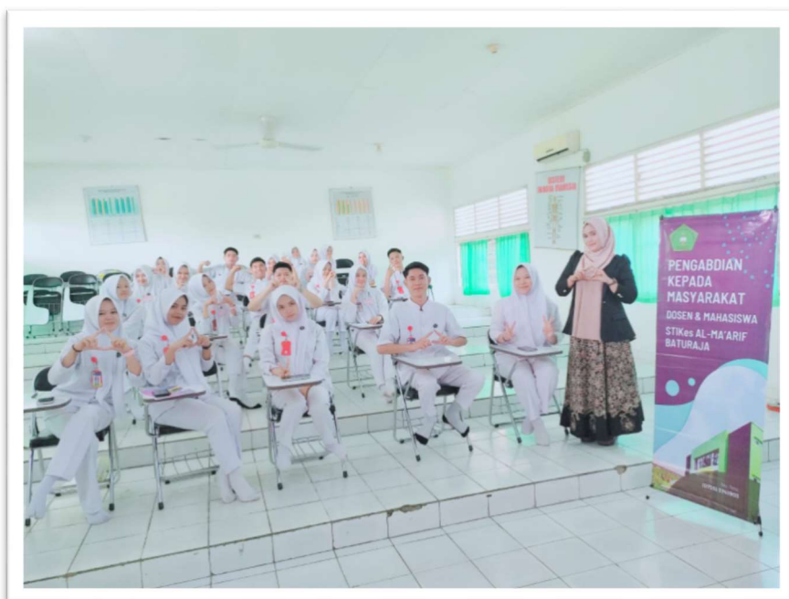
Figure 1. Students write down the financial management they have done