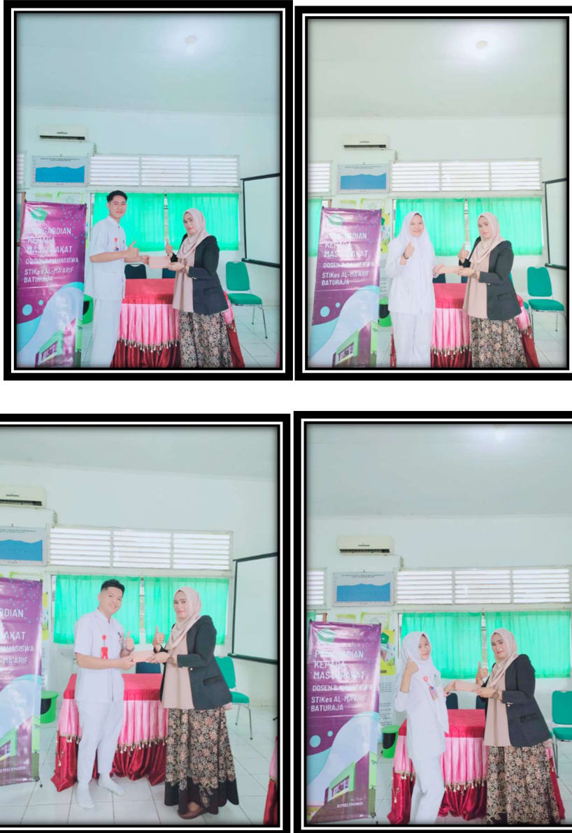
Figure 2: Awarding door prizes to students

This third session was closed with thanks and the awarding of door prizes for the appreciation of the attention of students in participating in simple financial management counseling which was continued with the provision of questionnaire forms.