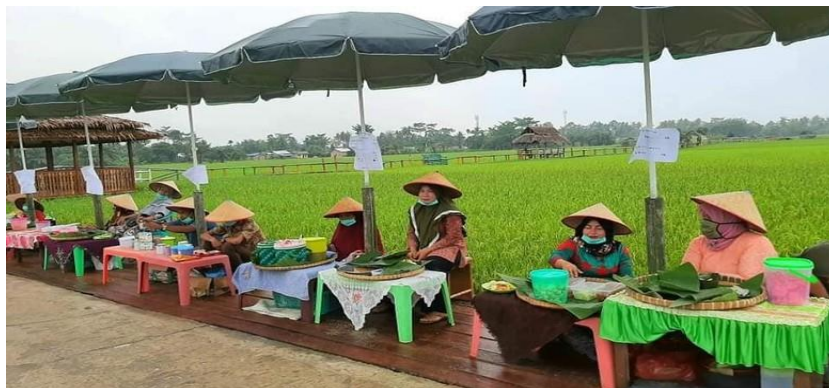
Figure 5. Paloh Naga Traditional Market

The second spot is the Paloh Naga Traditional Market (PTPN), located in the Paloh Naga tourist area. PTPN is a creative economy concept promoted by BUMDES Denai Lama and kelompok sadar wisata . The Paloh Naga Traditional Market is a turnover target to promote the Paloh Naga tourist attraction and the economy of the people of Denai Lama Village; PTPN only involves people from Denai Lama Village whose economy is middle to lower. By the vision and mission of BUMDES for the community's welfare. The traditional Paloh Naga market is only open on Saturday and Sunday mornings. PTPN is located in Hamlet 4, Denai Lama Village. Visitors will be served breakfast in the middle of the Paloh Naga rice fields every weekend. Moreover, another activity is, holding the opening of the Paloh Naga Traditional Market on the same day every day. Visitors can enjoy breakfast in the middle of the rice fields, accompanied by gamelan music and traditional Javanese and Malay dances.