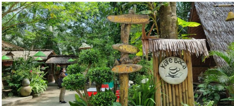
Figure 6. Café baca , Kampung Denai Lama Tourism Village

Another interesting thing is the existence of educational tours, namely Café baca . Café baca is a cafe in the Kampong Lama Tourism Village that provides various readings for visitors, of which there are approximately 1800 titles of books. The establishment of this reading cafe is an effort made to support the literacy development program.