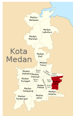
Figure 3. Map Area of Denai Lama

The area in Denai Lama Village and its surroundings is tropical, where the dry season occurs in January, February, and May to August, while the rainy season occurs in March, April, and September to December. Meanwhile, Labu Beach has a relatively hot climate with a maximum temperature of 34 degrees Celsius (Durlee, 2020). Referring to the conditions and geographical location, the position of Denai Lama Village has a strategic value as access to utilize tourism potential. That way, this village was conceptualized as a tourism god in 2016. Then the Deli Serdang Regency Tourism Office only realized it in 2017, and the Kampoeng Lama Tourism Village has been operating since 2018.