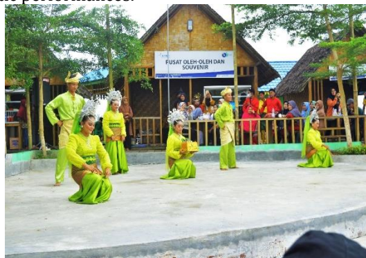
Figure 4. Dance Performance at the Sanggar Lingkaran Spot in Kampoeng Lama Tourism Village

Denai Lama Tourism Village has developed and is named Kampoeng Lama Tourism Village as a branding effort. Kampoeng Tourism Village has two spots. The first spot is the center of art and culture, commonly known as the sanggar lingkaran . Sanggar lingkaran is located in Dusun 2, Denai Lama Village. The sanggar lingkaran is a traditional dance studio that was developed and used as a tourist spot on a cultural basis. The primary reason for starting this art studio was to prevent children from harmful things, such as from the stage of erotic performances.