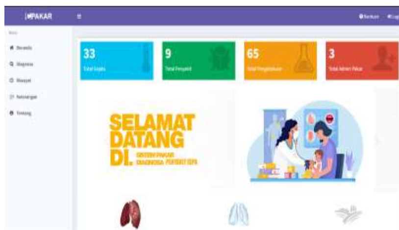
Figure 2 Main Page

This main page is the initial display when visitors (users) visit the web system expert on ARI disease in children. The menu on this web is like Home, About ARI, Diagnosis. It can be seen in Figure 2.