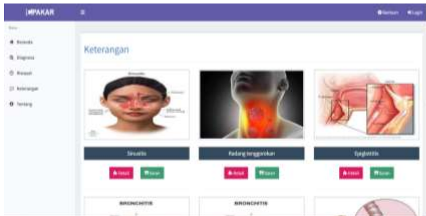
Figure 3 Page Description