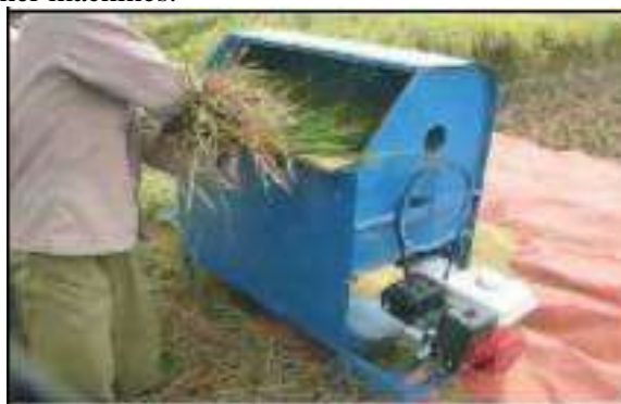
Figure 2. Diesel Rice Thresher Machine

Technological developments have played a big part in the development of rice threshing machines, until humans thought of making a simple machine using diesel to thresh rice. The following are diesel rice thresher machines: