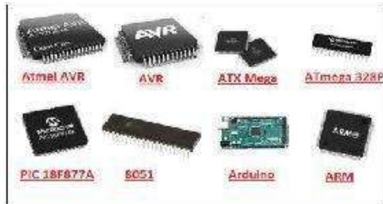
Figure 4 Microcontroller Chip

A microcontroller is a chip in the form of an IC (Integrated Circuit) which can receive input signals, process them and provide output signals according to the program entered into them. The microcontroller input signal comes from the sensor which is information from the environment, while the output signal is directed to the actuator which can have an effect on the environment. So in simple terms, a microcontroller can be thought of as the brain of a device/product that is able to interact with the surrounding environment.