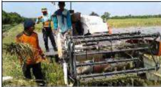
Figure 3. Modern Rice Thresher Machine

From the development of rice threshing machines above, humans, especially farmers, can save time and operational costs in harvesting rice, so that farmers become more productive.