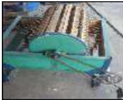
Figure 1. Simple rice threshing machine

The following is a simple rice thresher, this tool can be made by combining wooden planks with bamboo which are arranged in such a way as in the picture: