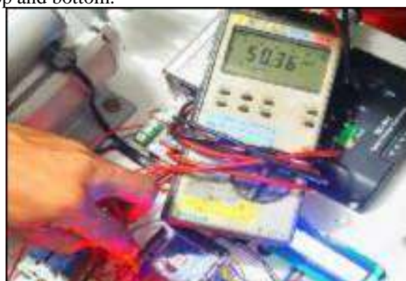
Figure 10. Proximity Sensor Testing When Detecting

The author uses 2 proximity sensors placed right above the filter fan. The sensors are arranged parallel to the top and bottom.