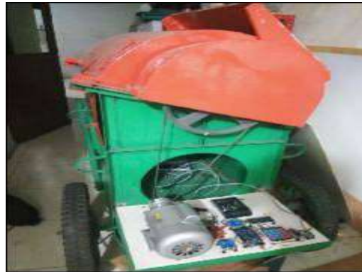
Figure 8. Automatic Rice Thresher Machine

separated from Then the rice stalks will be separated again from the dregs that are still attached to the rice. This separation process is called the Filterization system, where the motor will rotate to exhale rice dregs based on the amount of rice that falls, the more rice that falls, the faster the motor speed will be. After the filtering process is complete, the rice will be weighed automatically by this machine too.