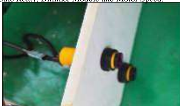
Figure 9. Location of Proximity Sensor

Testing is carried out after the tool work is completed and is carried out on each block. Circuit testing aims to see the results of the circuit that has been designed. The test result data is used to analyze and carry out circuit repairs if the results obtained are not as expected. In this section, circuit testing is carried out based on the block diagram. The stage to be tested is the Proximity Sensor, Module Relay, Dimmer Module and Motor Speed.