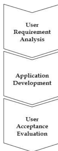
Figure 1. Research Stages

The research consists of three stages aimed at developing an effective adverse drug reaction monitoring system in pharmacies as show in Figure 1. The first stage involves a comprehensive analysis of user needs, engaging stakeholders such as pharmacists and end-users, to identify key features and functionalities required. Subsequently, the second stage employs Agile methodology in application development, enabling iterative design, development, and testing to accommodate changing needs and user feedback. The final stage encompasses the functional evaluation of the developed application and the assessment of user satisfaction with its usability and performance, with the objective of ensuring the application's alignment with user needs and obtaining valuable feedback for further improvement.