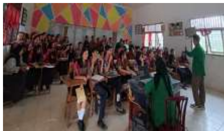
Figure 4. Session Discussion

Participant given chance For ask and discuss about issues around elections, so that created active interaction between speakers and participants or student. High Student Interest To Activity Socialization Shown With Many Students Participating To Discussion.