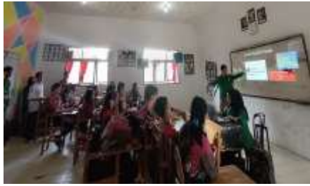
Figure 3. Delivery of Material

Speaker to expose material related election using PowerPoint presentation media and animated videos. The material presented includes :