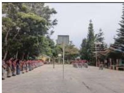
Figure 1. Bina Bangsa Private High School Three Juhars

Bina Bangsa Private High School Three Jhar is A institution School Senior High School. Private High School Bina Bangsa Three Juhars are located at Jl. Pasar Baru No. 36, Deli Serdang Regency. Private High School This to start his journey on 1986.