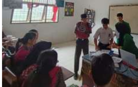
Figure 6. Socialization

After do socialization student more understand about terms and conditions become voters beginners and procedures correct election.