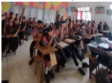
Figure 5. Active Discussion

Participant given chance For ask and discuss about issues around elections, so that created active interaction between speakers and participants or student. High Student Interest To Activity Socialization Shown With Many Students Participating To Discussion.