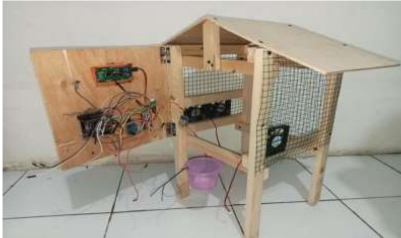
Figure 1. Design of the Miniature Poultry House Device

This research can also be categorized as development research, as it goes beyond theoretical discussion by encompassing the processes of system design, implementation, testing, and evaluation of a prototype developed in a simplified form.