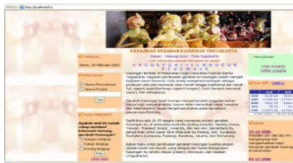
Figure 6. User main menu

The picture above is the main menu of this web. On the right there are facilities for member logins, member lists, currency exchange rates and news about Kasongan pottery. On the left, there is a date menu to find out the current date, search by category, company name and product name, as well as a poll for this web visitor's poll. While in the middle there is a front facility for Kasongan profiles, contact us with admin addresses and there are facilities for sending emails to admins, and a map of Yogyakarta. Below it is a link to the company name in alphabetical order. To see the Kasongan pottery companies listed on this web based on the first letter of the alphabet of the