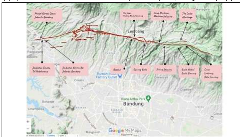
Figure 1 Lembang Fault

The Lembang Fault stretches approximately 29 kilometers from Ngamprah Padalarang in West Bandung Regency to Palintang Pasirwangi Ujung Berung in Bandung City [16] [17]. Although the last recorded earthquake occurred in the 15th century—around 500 years ago—the fault remains potentially active and could cause future earthquakes [17] [18]. The Lembang Fault is said to be capable of generating earthquakes with magnitudes of 6.5 to 7 on the Richter scale. The average fault movement pattern is left-lateral strike-slip, but in the eastern part, it shifts to a normal-oblique movement [19] [20]. Currently, the Lembang Fault is in an energy release phase, with shifts ranging between 3 and 5.5 mm/year. Nevertheless, researchers are not yet able to predict when an earthquake will occur along the Lembang Fault [21] [22]. Although it is not among the most active faults, the Lembang Fault's proximity to densely populated areas makes its movement potentially very dangerous [23] [24].