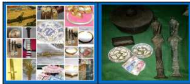
Figure 1. Traditional wedding dowry