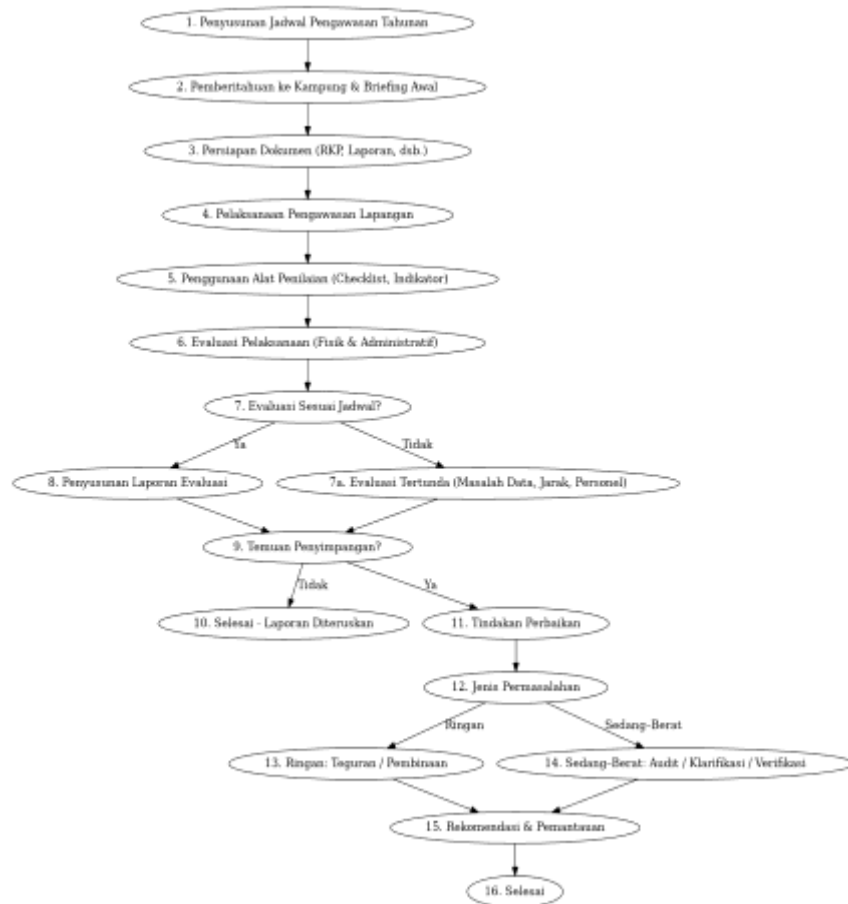
Figure 4.2 Mechanism Supervision Village Fund Budget in the District Jagebob, Merauke Regency

Based on results interviews and observations, mechanisms supervision Village Fund budget in the District Jagebob, Merauke Regency can depicted visually in the following diagram as representation from practices that take place in the field.