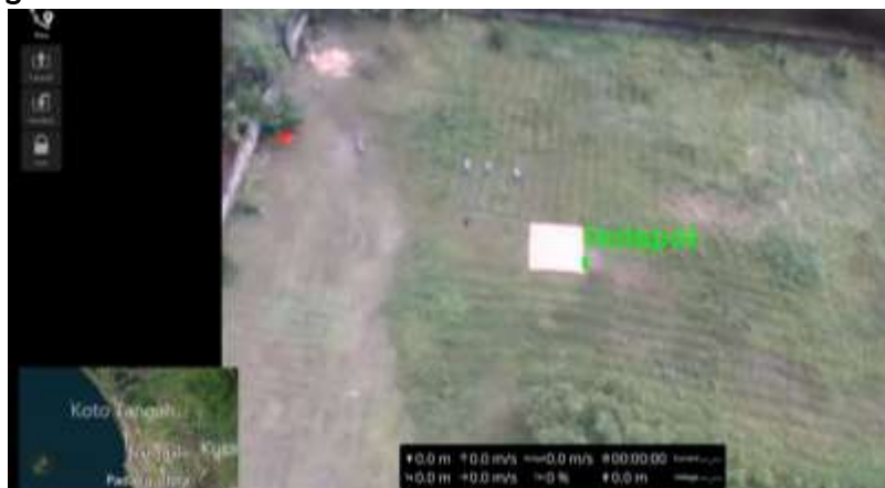
Figure 5. Ground Control Station (GCS) interface used in this research to monitor real-time video streaming and flight telemetry from the UAV.